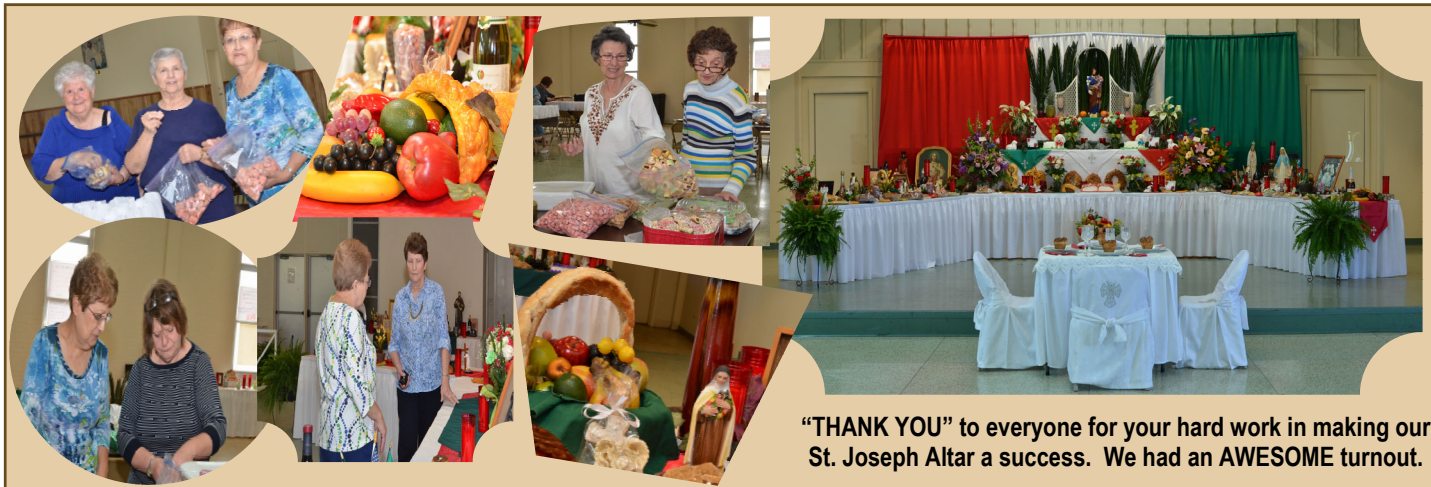
"THANK YOU" to everyone for your hard work in making our St. Joseph Altar a success. We had an AWESOME turnout.