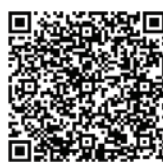
Our Lady of Sorrows