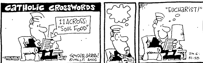
THE BODY & BLOOD OF CHRIST

We are currently seeking a part-time House Manager! Work hours are, every other weekend, from 6:00 p.m. Friday through 6:00 p.m. Sunday. The house manager is required to spend Friday and Saturday night in the house. The preferred candidate will be a mature Christian woman who can act as a mentor and liaison to the women who live at Hannah's House. It is imperative that she has a wealth of compassion for vulnerable pregnant women and small babies, while maintaining a spirit of accountability. She is required to cook one meal during the shift and attend to light housekeeping chores not already assigned to the residents. It is preferred she have her own car and insurance with a good driving record. This position is ministerial in nature, not high-paying, so it would be helpful if the candidate is looking to do ministry or mission work. Apply www.hannahshouselansing.org OR www.indeed.com .