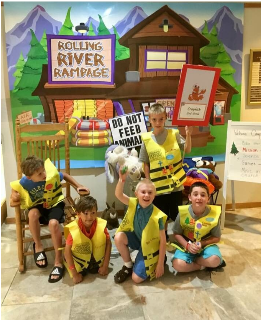
St. James, Mason, Michigan