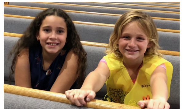
Sts. Cornelius & Cyprian, Bunker Hill