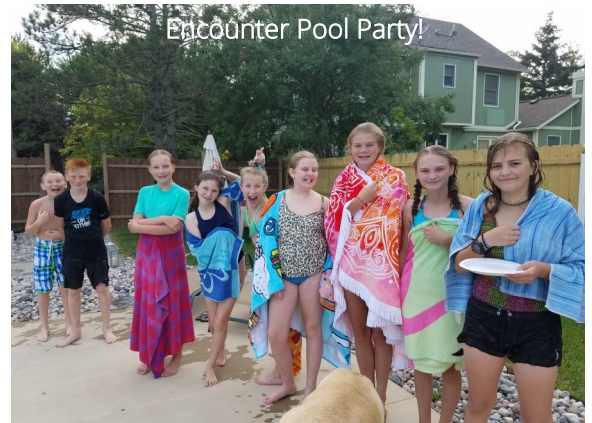
Encounter Pool Party!