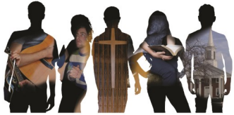
YOUTH NEWS & EVENTS