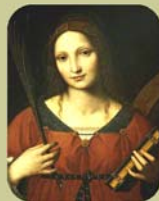
Catherine of Genoa