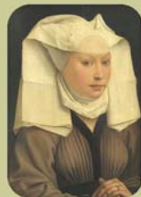
Julian of Norwich