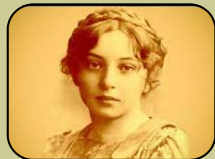
Catherine of Sienna