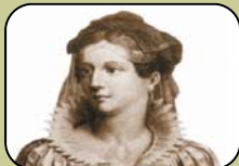
Hildegard of Bingen