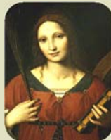
Catherine of Genoa