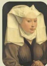
Julian of Norwich