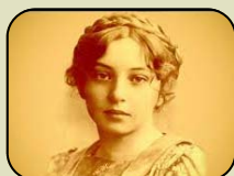
Catherine of Sienna