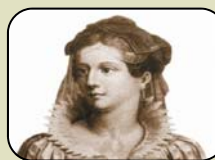
Hildegard of Bingen