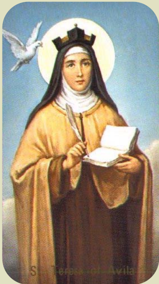
St. Theresa of Avila