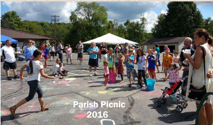
Parish Picnic 2016

Weekday and Holy Day Masses: Please see inside bulletin.