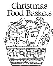
Christmas Food Baskets

CCD New Schedule: Our new time for CCD will be between 9:45 a.m.–11:15 a.m., starting on Sunday December 3 rd .