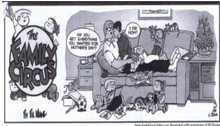
from JoyfulNoiseletter.com Reprinted with permission of E! Entertainment