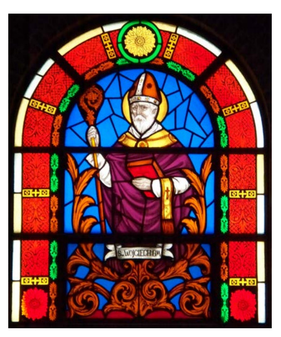
ST. WOJCIECH, Bishop & Martyr Feast Day April 23

http://lordcalls.com/prayers-for-different-people/a-prayer-for-mothers