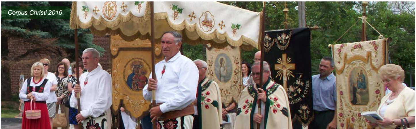
Corpus Christi 2016

We are a welcoming Roman Catholic Parish that cherishes the Polish heritage of our founders and celebrates the diversity of all who enter, thus striving to give glory to God through worship and service to the community.