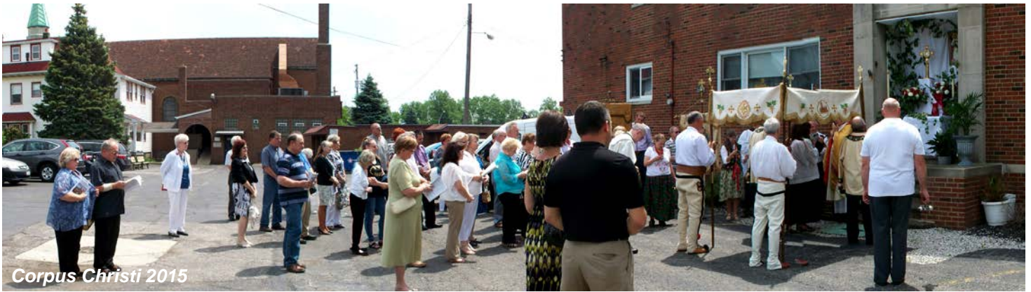
Corpus Christi 2015

We are a welcoming Roman Catholic Parish that cherishes the Polish heritage of our founders and celebrates the diversity of all who enter, thus striving to give glory to God through worship and service to the community.