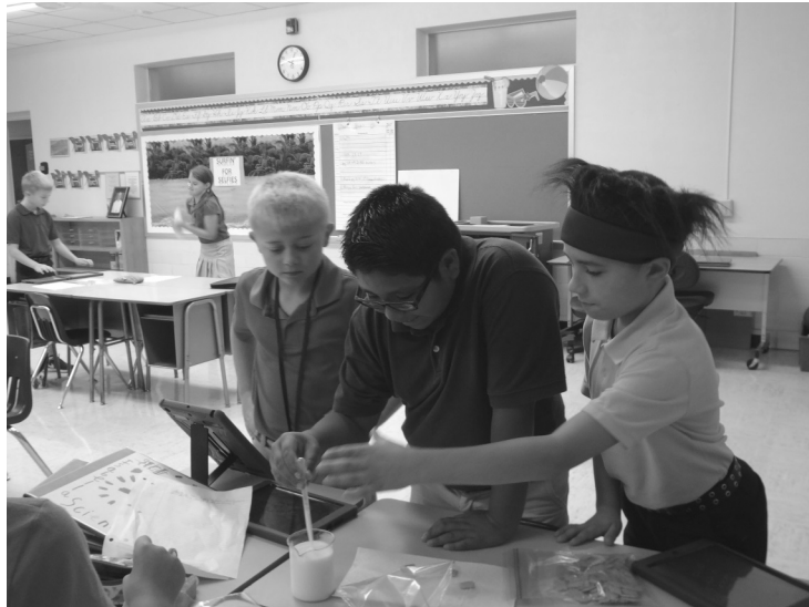
Fourth graders love science class, especially when they get to do an experiment or two!