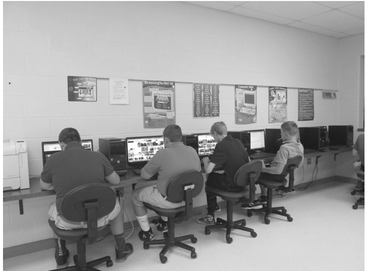
7th Grade Technology Class