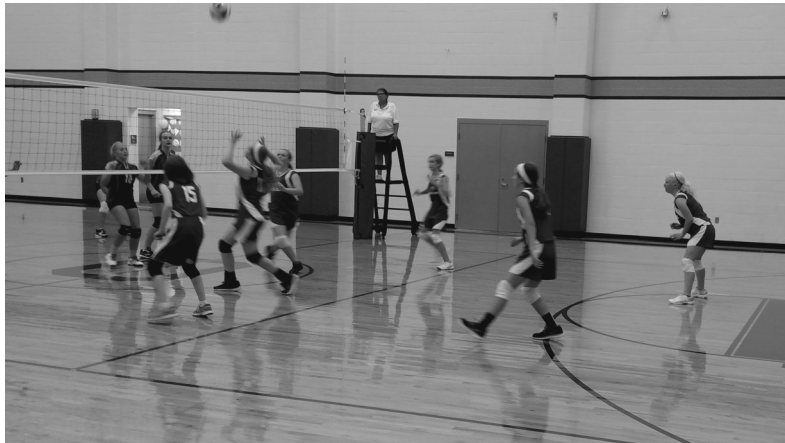
Go Falcon Volleyball!