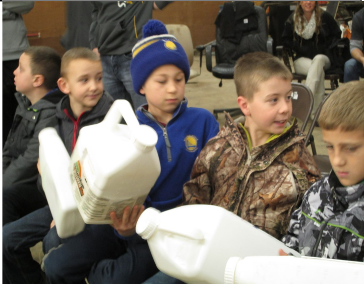
Top left are K-3 students. They were able to bring in used books for resale. Pictured left, are the 3rd grade at the Farm Safety field trip. At the bottom are paintings by the 7th grade class done in their Art Class.