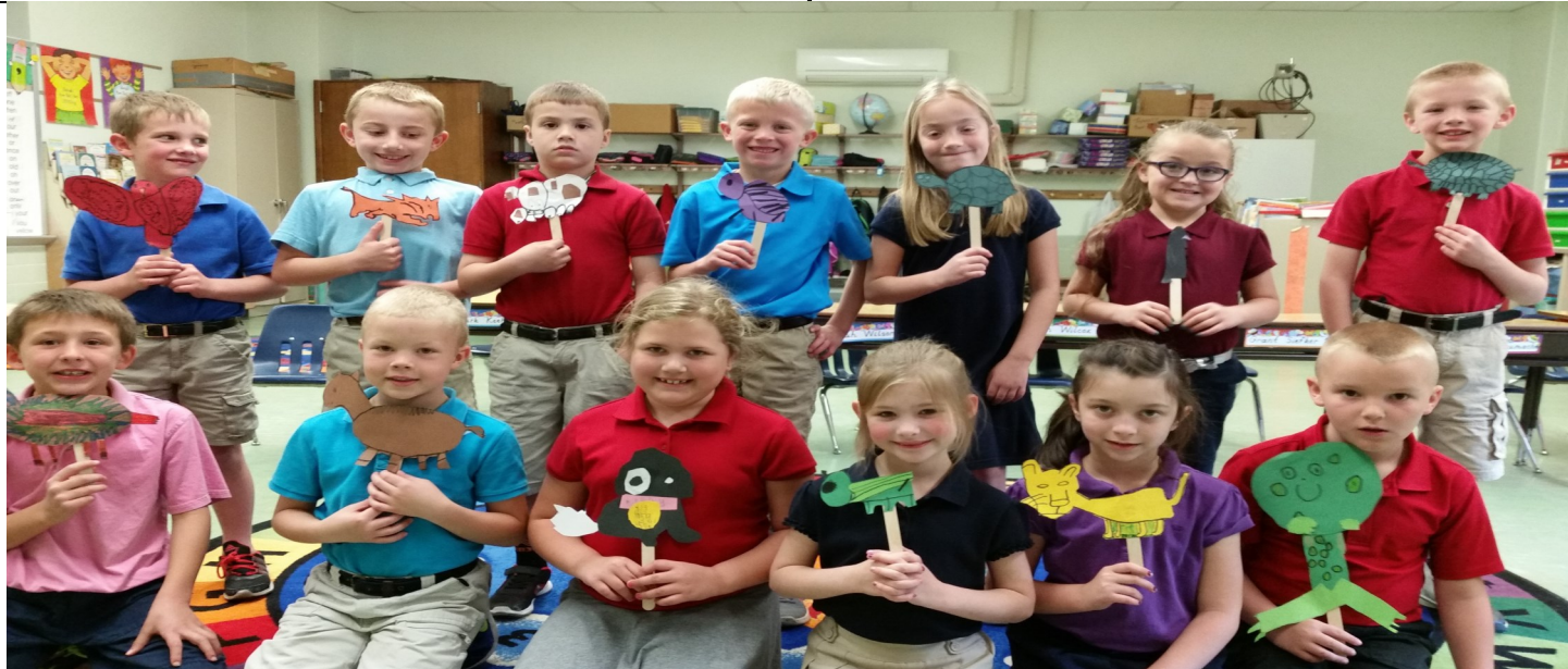
Top is a picture of the first graders displaying the characters that they made for the story in their reading class called "Do You Live In A Nest". They really enjoyed making the characters and putting on the play .