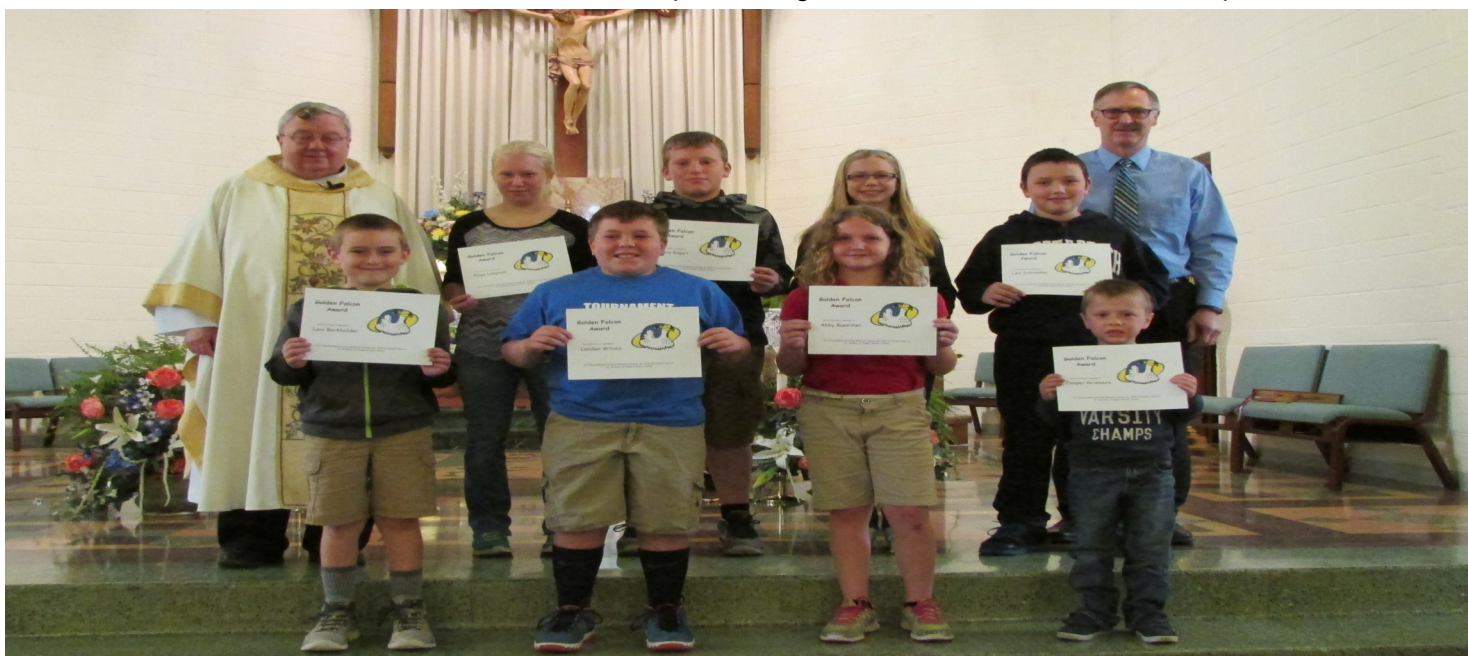
Below is the Golden Falcon Award Winners For April. Congratulations GFA Students for April.