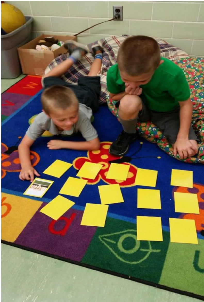
This week St Anthony students celebrated our Constitution with classroom activities. The First Grade learned about the Constitution this week also. Above are first grade students playing a matching game with picture cards relating to the US Constitution .