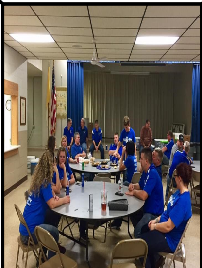
A Big Thank You to all the Bingo Crew