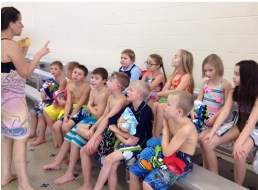
The Second Grade Class is learning to swim at the YMCA the next four Friday afternoons. Above and below are picture of them at their first class.