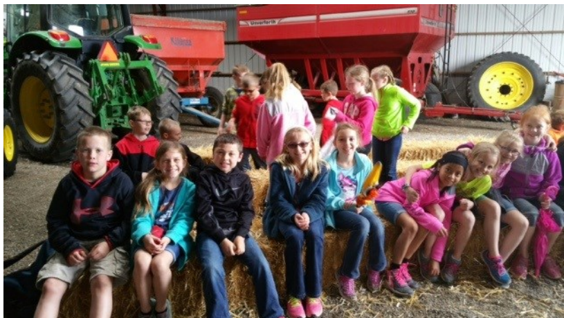
Top Left the First Graders received free trees from the Soil and Water District. They are all excited to plant them. Below Left are the Third Graders at the Putnam County Farm Safety field trip this past Wednesday. All students watched demonstrations on how to be safe around farm machinery. They also witnessed a mock Life Flight of an ATV accident. Watching the helicopter land and take off was awesome. On the Right is a picture of the Fifth, Sixth, Seventh and Eighth Graders taken at Our Lady of the Most Holy Rosary Cathedral in Toledo ,Ohio. Students toured the cathedral last Tuesday. What an awesome field trip.