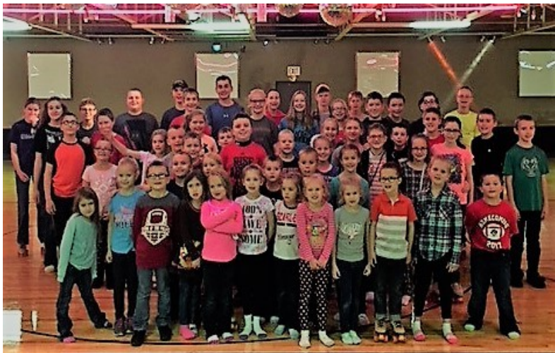
The School Advisory Council sponsored a K-8 Skating Party before Thanksgiving break. Pictured are the ones that attended. Thank You School Advisory Council

Dear Heavenly Father from above, Look down on Saint Anthony’s School with love. Please guide them and teach them. Fill them with your power So that in everything they do, They will be a delight to you! Amen.