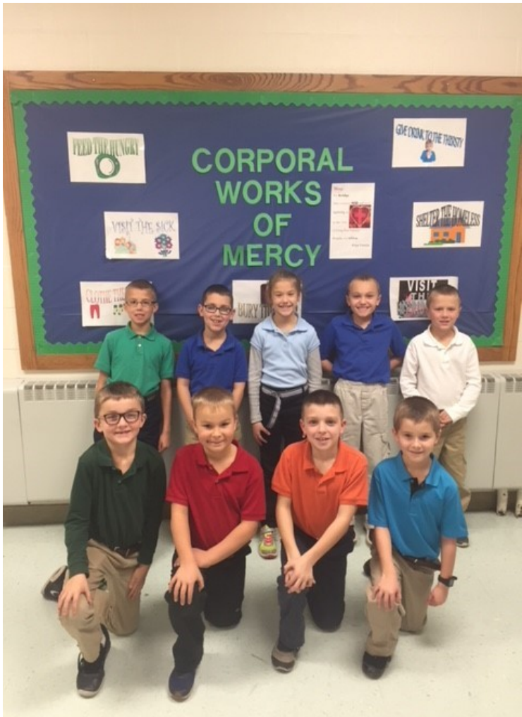
Pictured are the St. Anthony School Second Grade Students that recently participated in their first Sacrament of Reconciliation. Congratulations to all public and St Anthony Students for their commitment to their catholic faith.