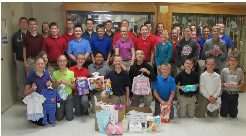
The High Flyers collected items for "Mary's Baby Shower."