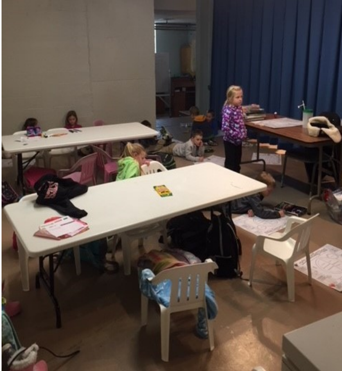
Top Left are the Eighth Grade in the Christmas Concert. Thanks to all that attended! Top right & bottom are the teachers and students having classes in the warm spaces on the 1st day back from Christmas break. We had heating trouble for a day until we could find the right part to fix the heating system in the 60's part of the school. Thanks to teachers and students that made it work!