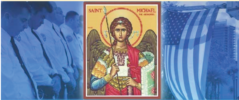
St. Mark the Evangelist and Mount Calvary Parishes

Please come and join us as we celebrate this special day!