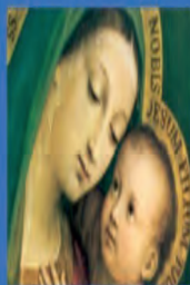
Our Lady of Good Counsel

1943 Mourne Road Parish 2018 Celebrating