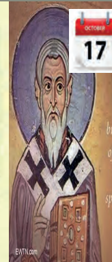
ST. IGNATIUS OF ANTIOCH

'Christianity is not a matter of persuading people of particular ideas, but of inviting them to share in the greatness of Christ. So pray that I may never fall into the trap of impressing people with clever speech, but instead I may learn to speak with humility, desiring only to impress people with Christ himself.'