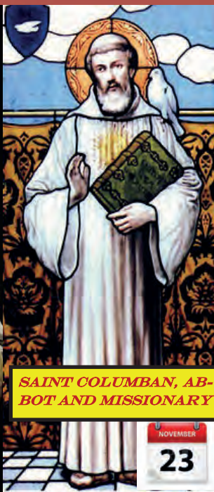
SAINT COLUMBAN, AB- BOT AND MISSIONARY