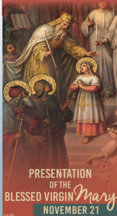
PRESENTATION OF THE BLESSED VIRGIN Mary NOVEMBER 21