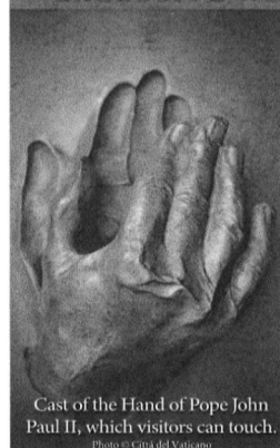
Cast of the Hand of Pope John Paul II, which visitors can touch.

VATICAN SPLENDORS A Journey Through Faith and Art