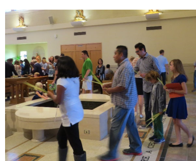
A previous Palm Sunday.