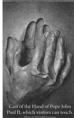
Cast of the Hand of Pope John Paul II, which visitors can touch.

VATICAN SPLENDORS A Journey Through Faith and Art