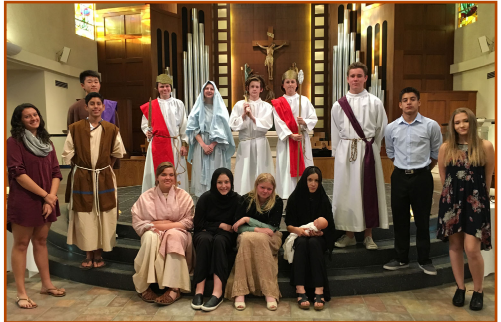
Our Confirmation Students who reenacted the Stations of the Cross on Good Friday.