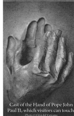
Cast of the Hand of Pope John Paul II, which visitors can touch.

VATICAN SPLENDORS A Journey Through Faith and Art