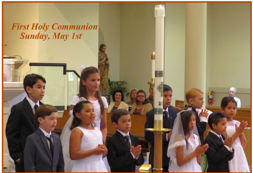
First Holy Communion Sunday, May 1st