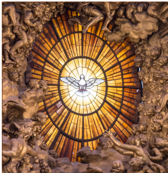
St. Peter's Basilica, Holy Spirit window, ca 1660