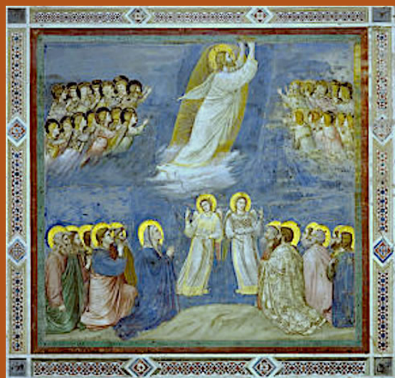
Giotto, The Ascension of Our Lord Scrovegni Chapel, Padua, Italy, 1305