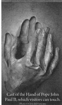
Cast of the Hand of Pope John Paul II, which visitors can touch.