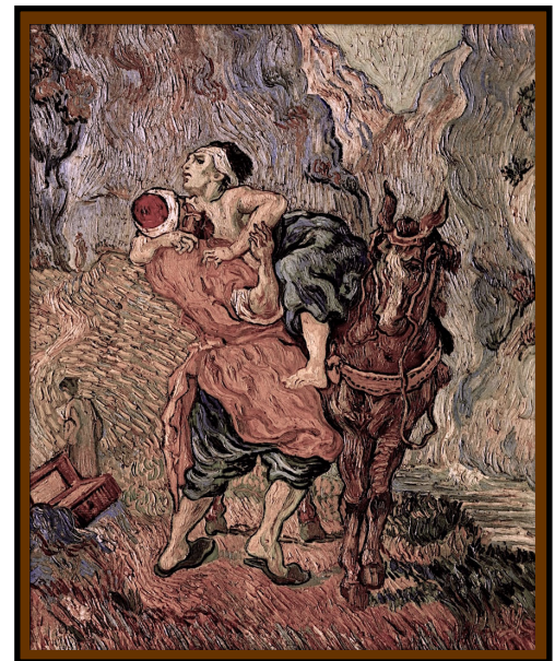
Van Gogh, The Good Samaritan, 1849, detail. (Modeled on a painting by Delacroix)