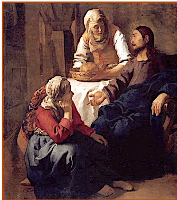
Christ in the House of Martha and Mary —Johannes Vermeer, (1654-1655)