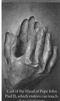
Cast of the Hand of Pope John Paul II, which visitors can touch.