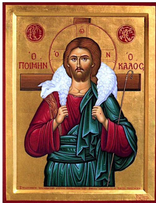
Christ the Good Shepherd, Orthodox Icon

RCIA (Rite of Christian Initiation for Adults) Welcome to all inquirers who are interested in our Catholic Church. We invite you to share our Inquiry Sessions which have been developed to answer your questions, to help you understand the Roman Catholic Church and to open the way to further Spiritual Growth. For more information, please call the Rectory Office, (805) 687-5215.