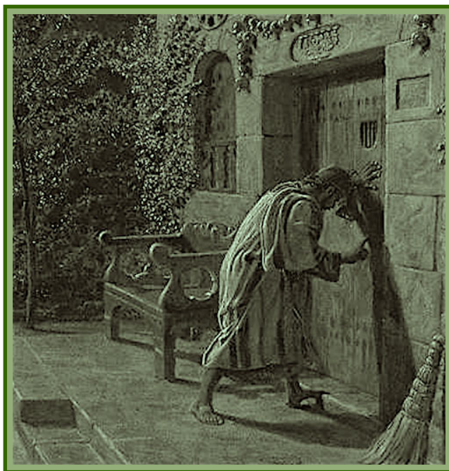
-William Holman Hunt, The Importunate Neighbor, 1895, detail

After the master of the house has arisen and locked the door; then will you stand outside knocking and saying, 'Lord, open the door for us.'