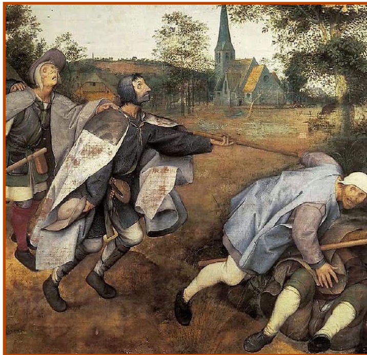
Pieter Bruegel the Elder, The Blind Leading the Blind, 1568, detail