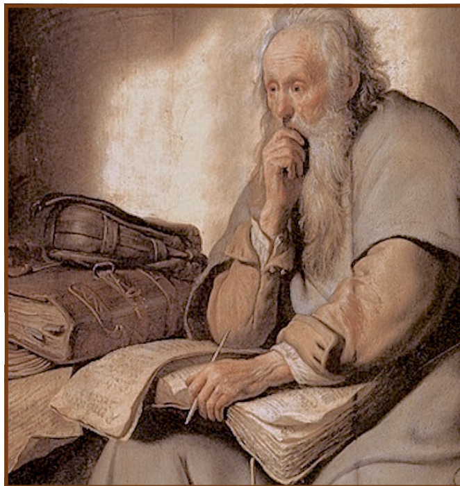
—Rembrandt, Saint Paul in his Prison , detail, 1627