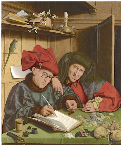
Followers of Marinus van Reymerswaele (1548-51) The Misers

“How much do you owe my master?” He replied, “One hundred measures of olive oil.” He said to him, “Sit down and quickly write one for fifty.”