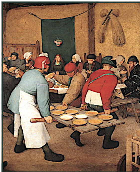
Pieter Bruegel Elder, Peasant Wedding, circa 1567, detail

“Put on your apron and wait on me while I eat and drink. You may eat and drink when I am finished.”