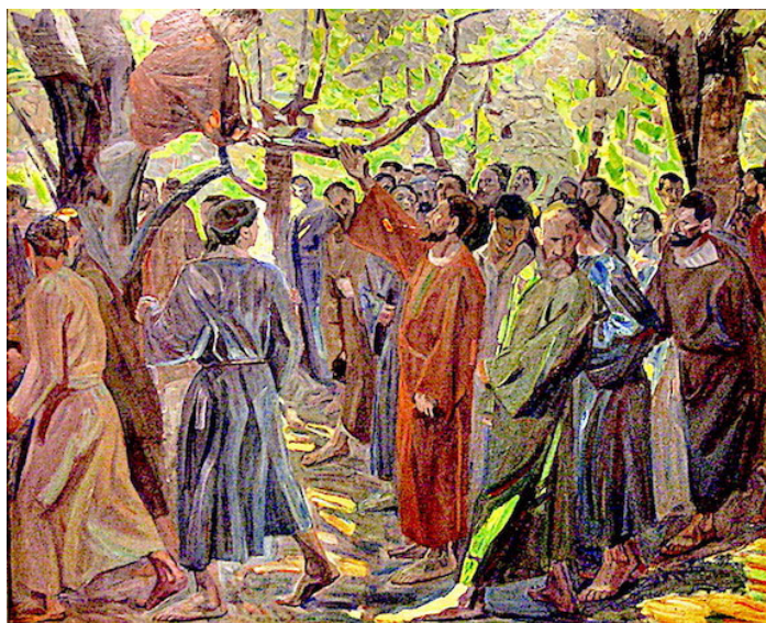
Zakaeus, Niels Larsen Stevns, Detail, 1913

“Zacchaeus, come down quickly, for today I must stay at your house.”