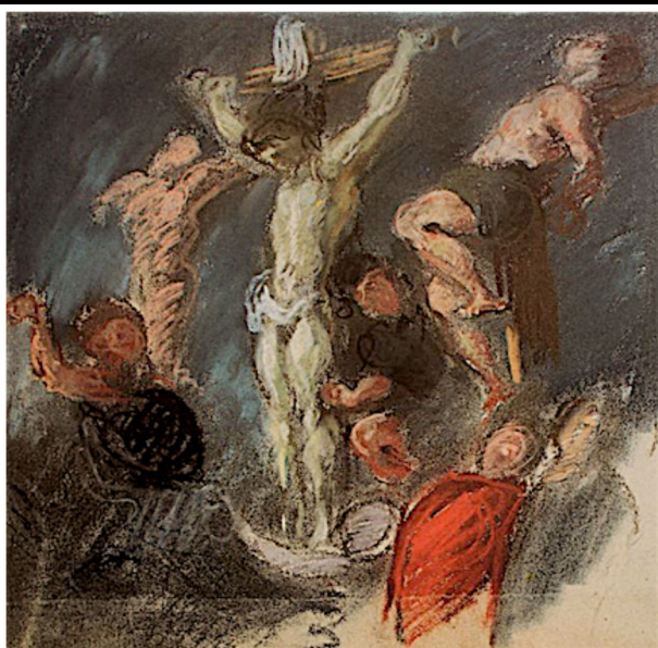
Eugene Delacroix, pastel, c. 1839, "Sketch after Ruben's painting, 'Coup de Lance' (Christ on the Cross)".