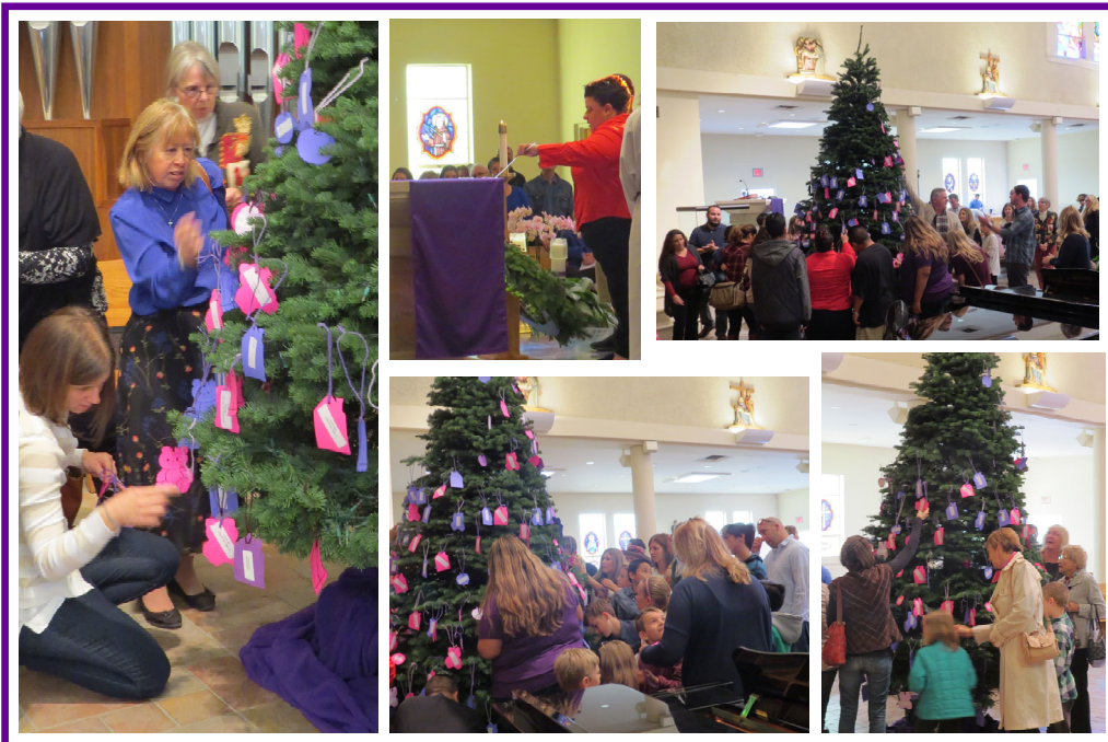
Last Sunday—9:30 a.m. Mass