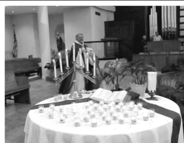
First Reconciliation Past Years

What ways do you show God's love to someone who is lonely or hurting?