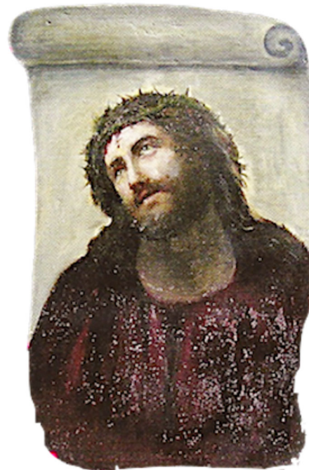
Elías Garcia Martínez, Ecce-Homo (Behold the man) 19th Century