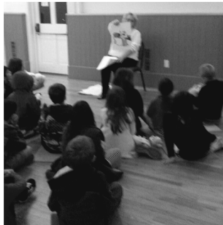
Parent/Student First Reconciliation Assembly was held Tuesday, January 12th