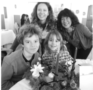
Advent Wreath Assembly (Last Year)

TODAY, Sunday, after the 9:30 Mass, our Religious Education Families, Teachers and Parishioners will meet in the Parish Hall to participate in a community project of making advent wreaths. We are asking families to bring small pine cones, berries, greens and any other types of decorations for the advent wreaths. We will have the wreaths and advent candles available. Donations to cover the cost of supplies would be appreciated. We will also have materials for the younger children to make advent chains. Please join us for this great family and community project.